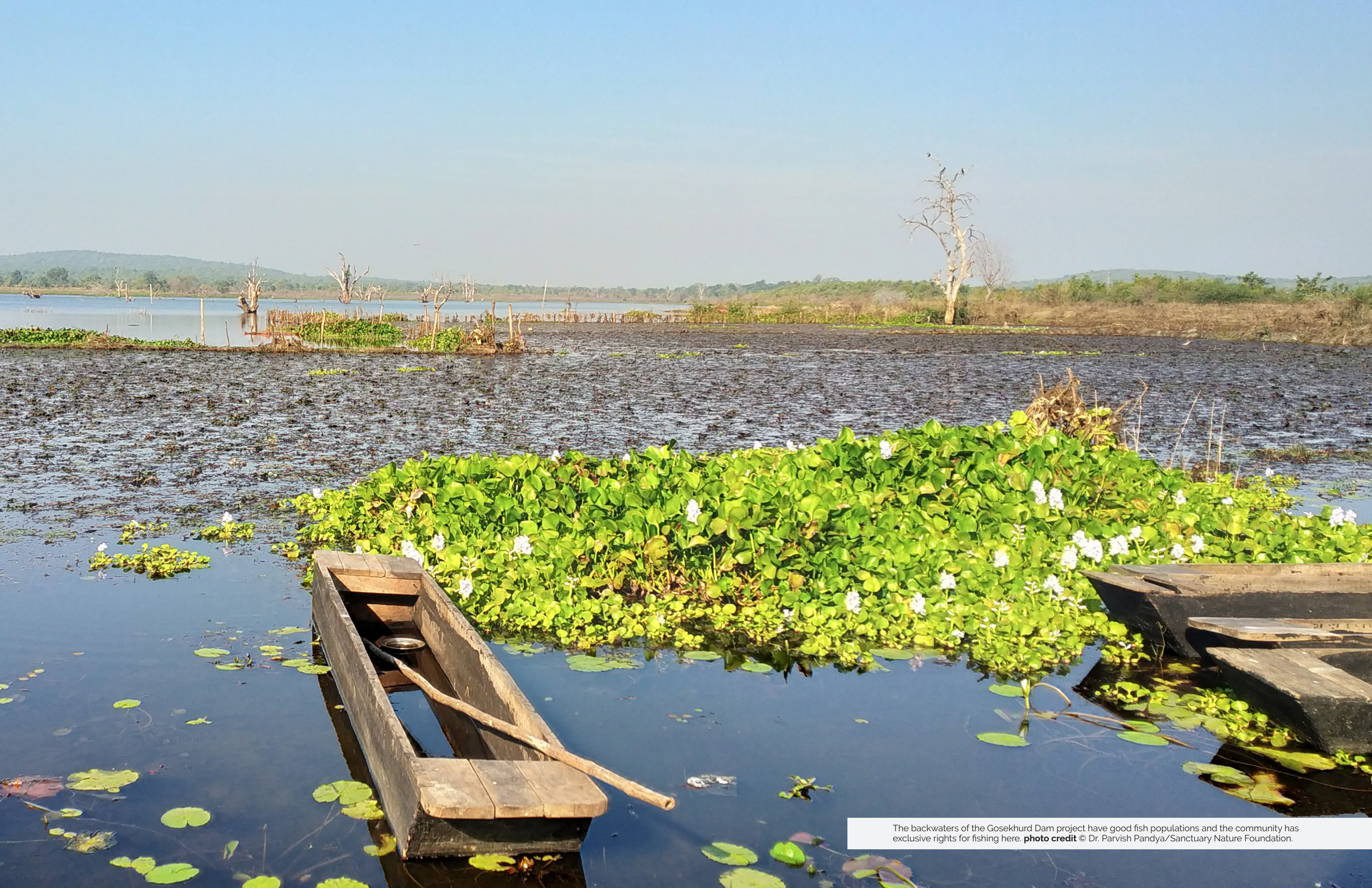
The backwaters of the Gosekhurd Dam project have good fish populations and the community has exclusive rights for fishing here.