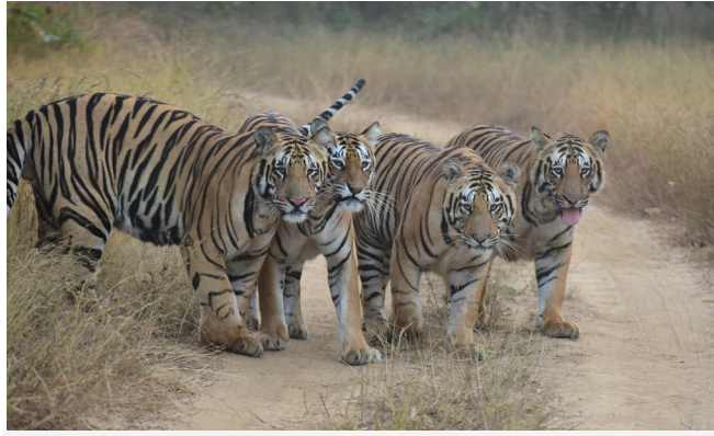
Figure 5 – The 189-sq.-km (73 sq. mile) expanse of Umred Pauni Karhandla Wildlife Sanctuary offers fairly good opportunities to see tigers and other mammals.