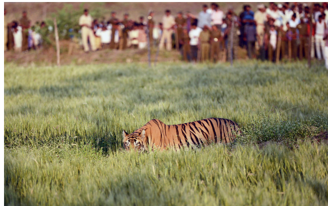
Figure 6 – Human-animal conflicts will soon be a thing of past, as COCOON offers additional spaces for biodiversity to flourish and disperse.

Nagpur district. He has only one dream – to protect tigers and their habitats. His drive, purpose, and single-minded devotion will certainly give the tigers of Umred-Karhandla and Tadoba an extra edge on life.