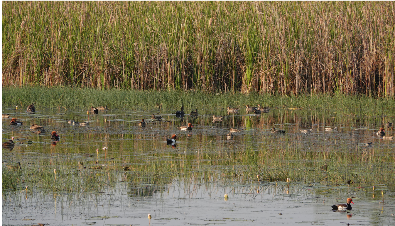
Figure 3 – The wetlands of Navegaon Reservoir to the northwest of the COCOON area attract thousands of migratory waterbirds.

ists in search of real nature experiences. The Sanctuary Nature Foundation and the COCOON Conservancy form a key part of a wildlife corridor that acts as a staging ground for tigers moving across a landscape that extends over 3,000 sq. km (1,158 The sq. miles). The COCOON pilot itself comprises privately owned land outside the buffer zone of the protected UPKWS forest, which is managed by the Maharashtra State Forest Department.